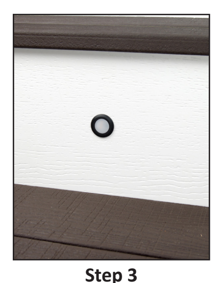
Feed Quick Connect wires through and press light until fully seated in the hole.