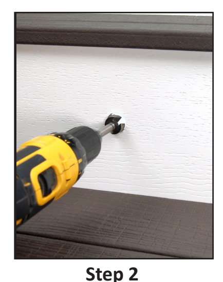
Drill 1" diameter hole through riser for recessed light using 1" forstner drill bit.

Determine location of recessed stair light and mark for drilling.